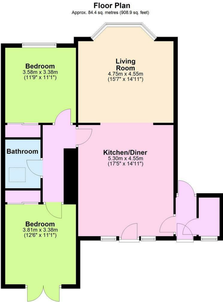
Total area: approx. 84.4 sq. metres (908.9 sq. feet)